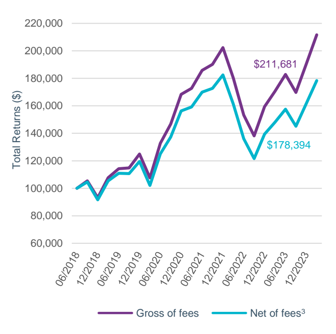
Hypothetical growth of $100,000 investment (since inception)

Performance data shown represents past performance and is no guarantee of, and not necessarily indicative of, future results. Returns shown are considered to be preliminary and are subject to change. Gross performance does not take into account transaction costs, investment advisory fees, custody fees, or other expenses that were charged to clients' accounts, or deductions for income taxes. Such fees will reduce investment performance over time. Standard deviation measures the risk of a portfolio or market. Indexes are not investments and do not incur fees and expenses and are not professionally managed. It is not possible to invest directly in an index.